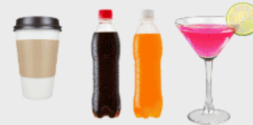
Caffeine & Alcohol