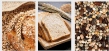
Grains & Legumes