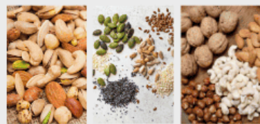
Nuts & Seeds