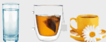
Water & Tea